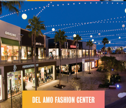
DEL AMO FASHION CENTER